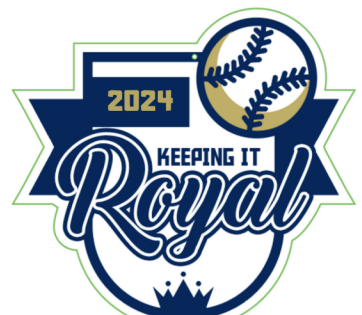
15" KC Baseball Wall Art