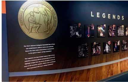
Winner PIA Best Graphics