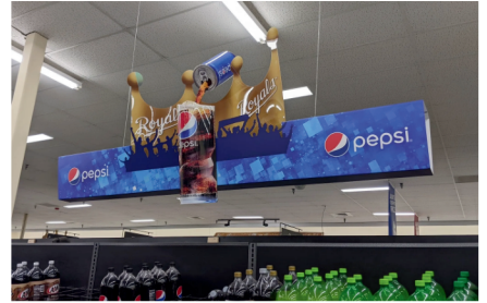
Winner PIA Best Grand Format